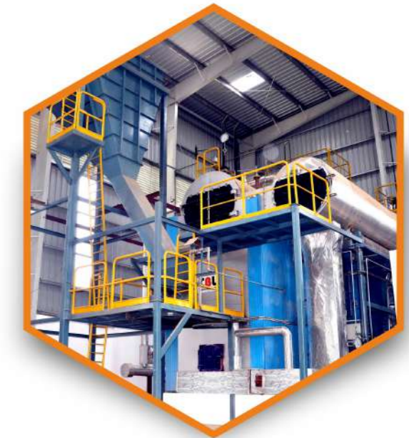
Intas Pharmaceuticals Ltd (Dehradun) 5TPH, 10.54 kg/cm 2